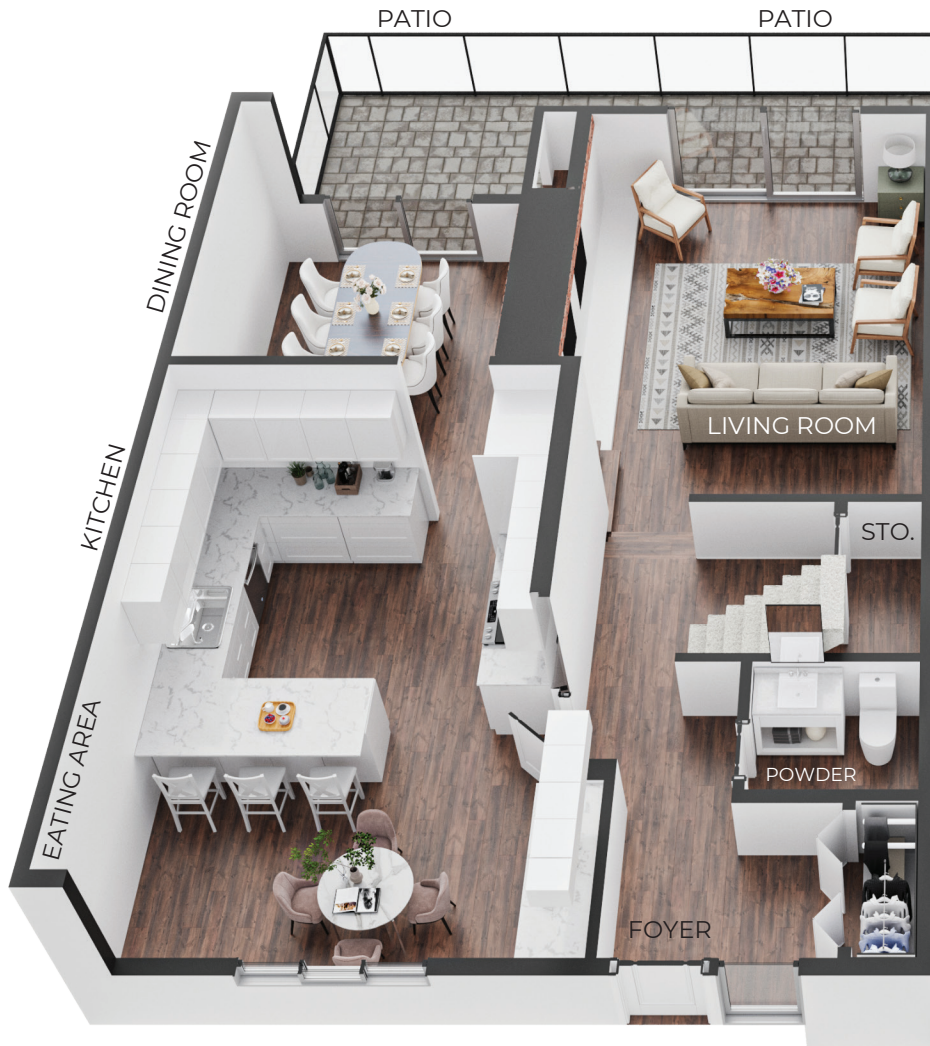
MAIN FLOOR PLAN Ceiling Height: 8'-0"